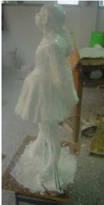
Forming of the mold around the clay.

The sculpture is created through extensive research of the original art work. Many hours of refining are required to get a finished Work in clay.