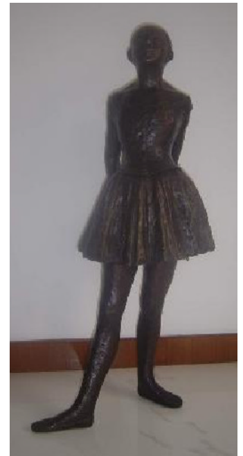
Application of a patina

After cooling for several hours, the clay shell is carefully taken away, freeing the bronze sculpture.